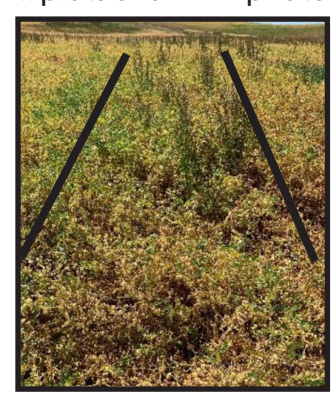
Outlook + Spartan PRE