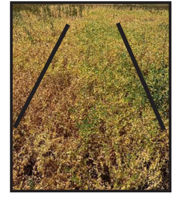
TOUGH 5EC 12 oz