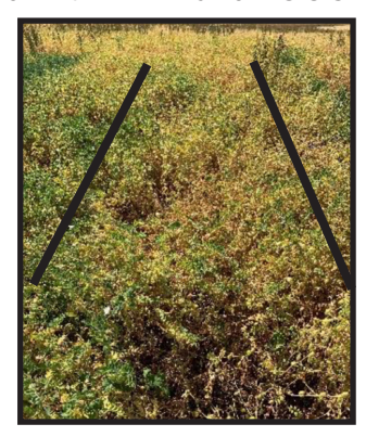
TOUGH 5EC 18 oz