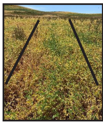
TOUGH 5EC 24 oz

*TOUGH 5EC (12 fl oz/acre) with COC had 92% control.